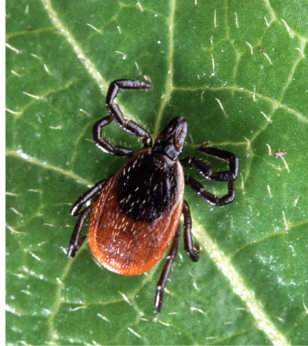
Black-Legged (Deer) Tick