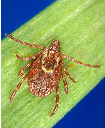
American Dog Tick